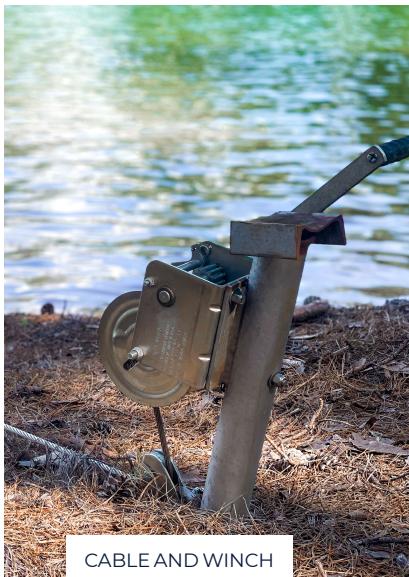
CABLE AND WINCH

Pilings also eliminate the need to have dock cables to the shore which can be a navigational hazard or restrict beach access.